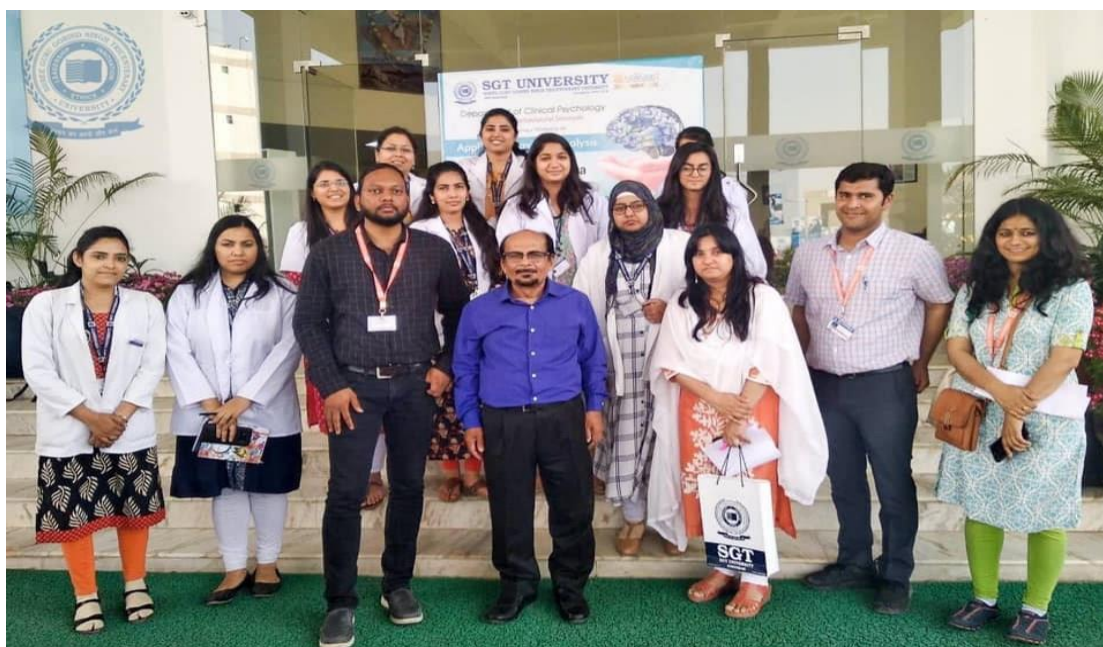
Group Picture of the Faculty Members of Department of Clinical Psychology, Students of M.Phil. (Clinical Psychology) and Resource person of the workshop

Glimpses of the session on applied behaviour analyses