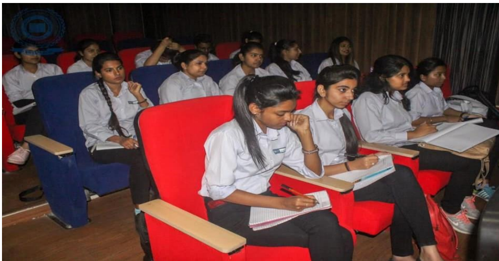
Students of Department of Clinical Psychology in the Workshop.